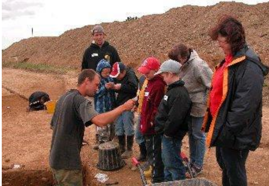
Figure 5 Explaining excavation techniques to school children.