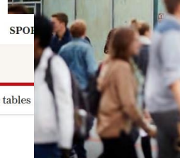
Students outside Manchester University.